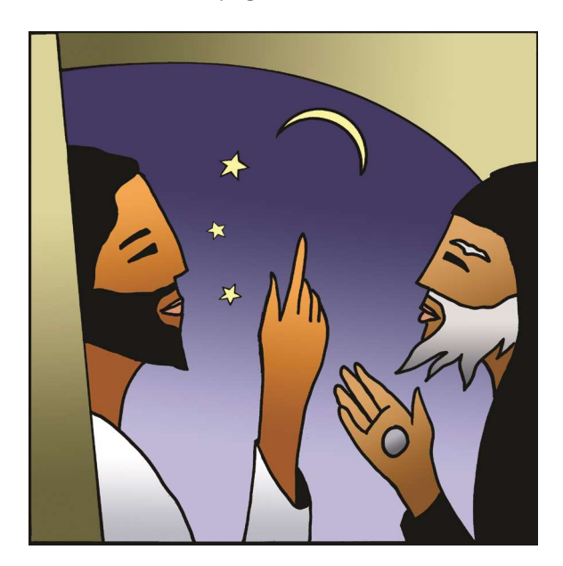
We Gather in Jesus' Name