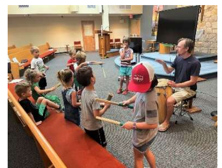
Praising God in rhythm