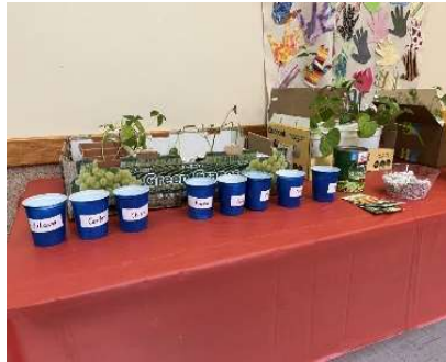
Seedlings and planted seeds