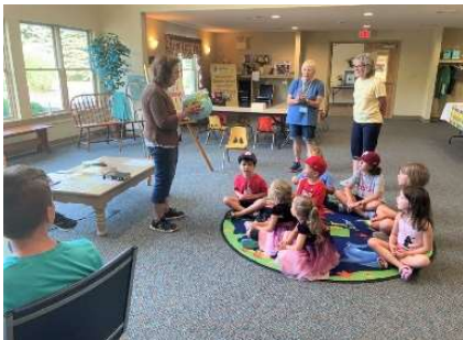
Attention to the lesson