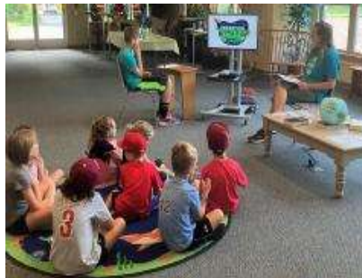
Captivated by the Word