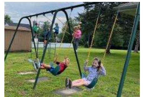
Kids in motion