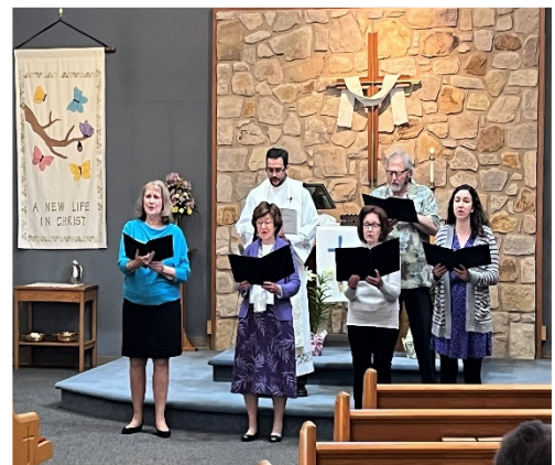
Easter Sunday Choir