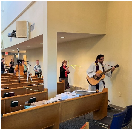
Palm Sunday Procession