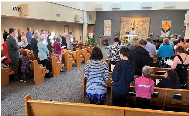
Easter Sunday Worship Service