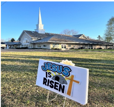
Advent Welcomes everyone on Easter Sunday