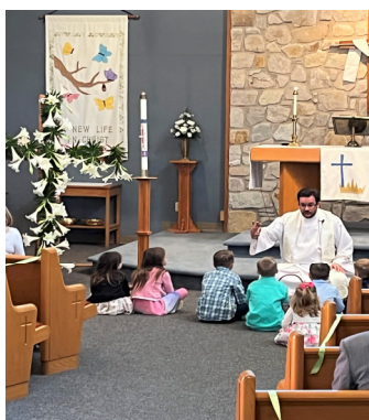
Easter Sunday Children's Sermon