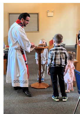
Explanation of Baptism