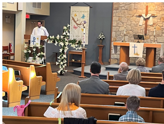
Preaching of God's Word