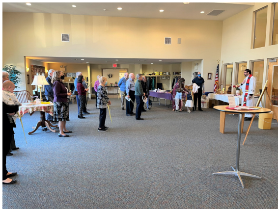
Distribution of Palms in narthex