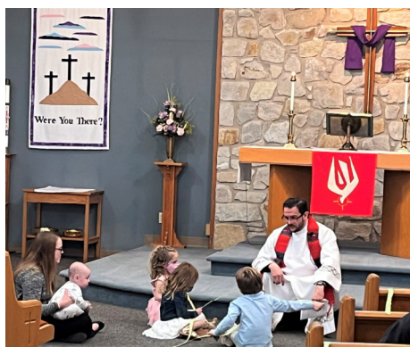
Palm Sunday Children's Sermon