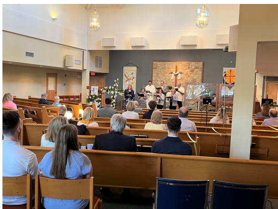
Easter Sunday with the Choir.