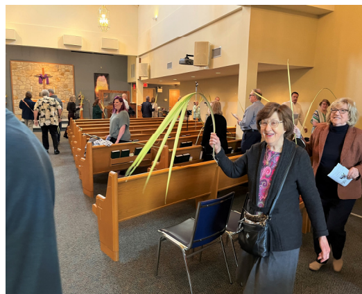
Parade of the Palms